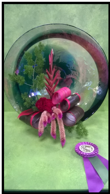
Blue Ribbon Flower Design "Serenity of the Sea" by Kathy B.

*Tickets required for luncheon**Please contact Mary Vacek at 281-419-6216 to buy tickets at $20/pp**